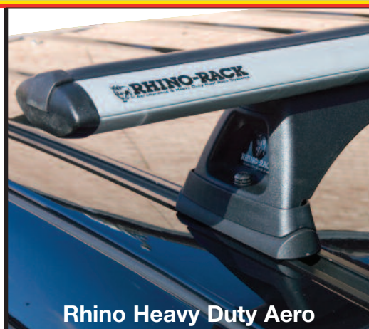
Rhino Heavy Duty Aero

Contact our friendly sales and customer service team if you require more information on our latest products.