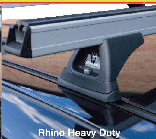
Rhino Heavy Duty